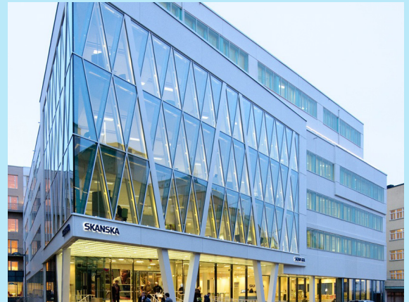
Skanska's headquarters in Stockholm

Skanska tracks these and other indicators of diversity and inclusion and publishes them on its website.