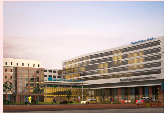
Artist's render of the Michael Garron Hospital redevelopment in Toronto, being carried out by EllisDon. Two nooses were discovered on the construction site on 10 June 2020

We must do more: we must actively endorse inclusivity across our business.