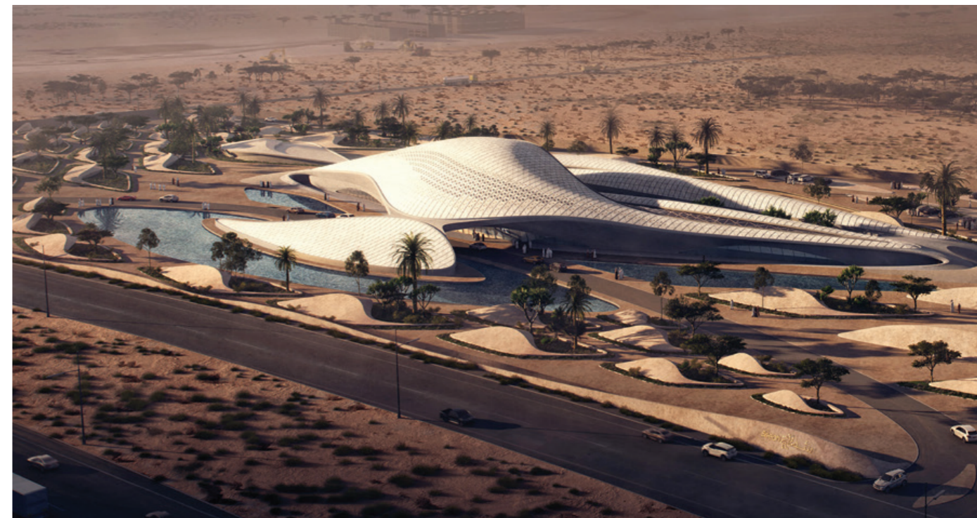
ZAHA HADID ARCHITECTS: Bee'ah Headquarters, Sharjah, UAE. The new Headquarters building is part of the Bee'ah's ongoing investment to transform attitudes and behaviours to support to achieve Zero-Waste to landfill targets. The Bee'ah School of Environment (BSOE) has hosted to date 174,000 children in over 210 schools across the emirate. Bee'ah Headquarters is LEED Platinum with ultra-low carbon and minimal water consumption

"Germany world's slowest growing construction market to 2030"