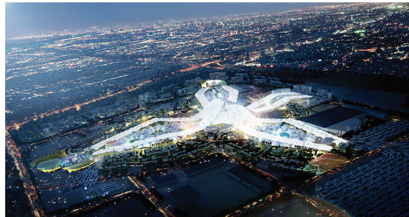
RLB: Expo 2020 Dubai. The United Arab Emirates will host the World Expo in Dubai in 2020. This is the first time that World Expo will be held in MEASA. Dubai's World Expo theme of Connecting Minds, Creating the Future and is expected to attract 25 million visits, 70% will be overseas

The US and Canada are also constrained, not because they are over-reliant on oil extraction as a source of economic activity and government revenues, but because the costs of extraction are higher than in most other regions. In the US, investment in mining exploration, shafts and wells has plummeted by 35% since the end of 2014. But innovation is driving down extraction costs, which will amplify the recovery when