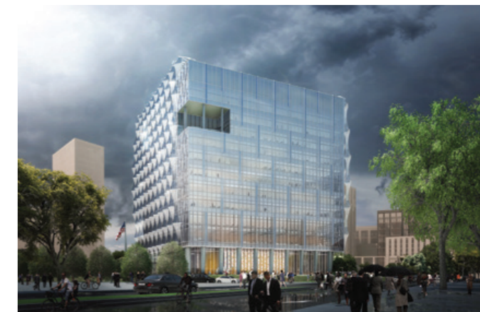
US embassy in Nine Elms, Battersea. The 11 storey cube-shaped building, one of the highest performing energy use and sustainability in the world