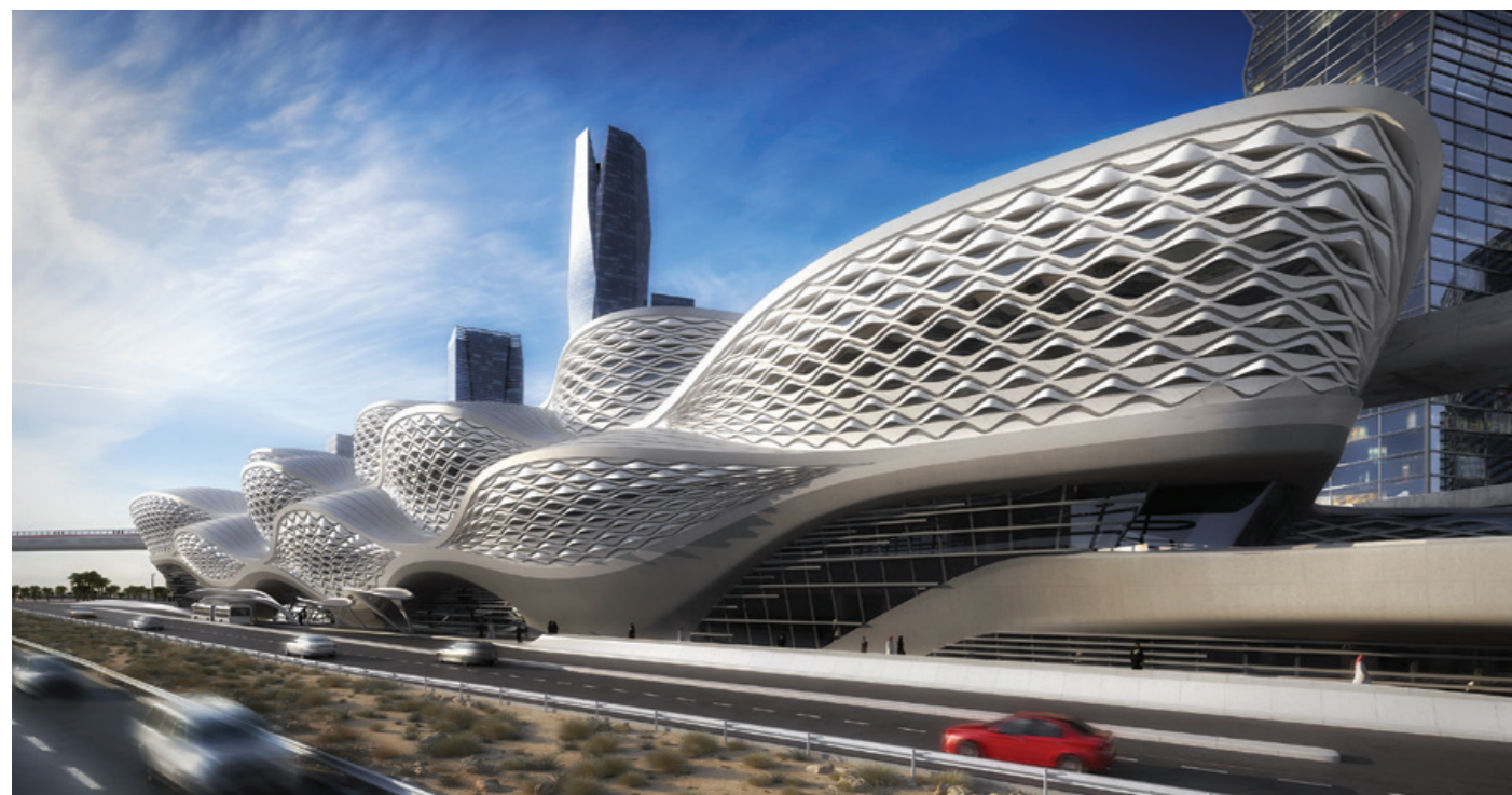
ZAHA HADID ARCHITECTS: King Abdullah Financial District Metro Station, Riyadh. With a population of more than five million, the capital Riyadh is Saudi Arabia's biggest city and is experiencing rapid growth. The façade patterning reduces solar gain while its geometric perforations contextualise the station within its cultural environment. The overall composition resembles patterns generated by desert winds in sand dunes