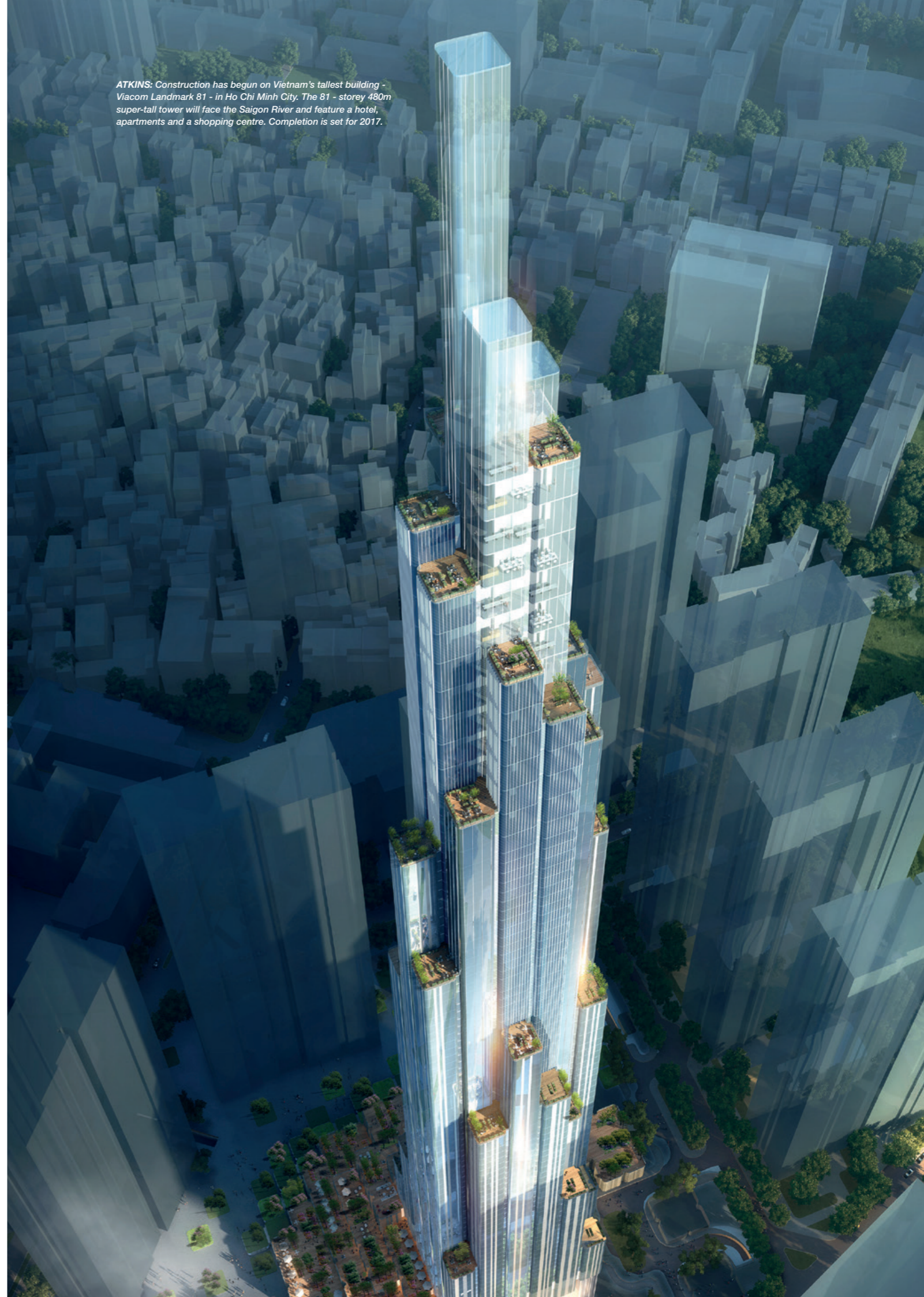
ATKINS: Construction has begun on Vietnam's tallest building - Viacom Landmark 81 - in Ho Chi Minh City. The 81 - storey 480m super-tall tower will face the Saigon River and feature a hotel, apartments and a shopping centre. Completion is set for 2017.