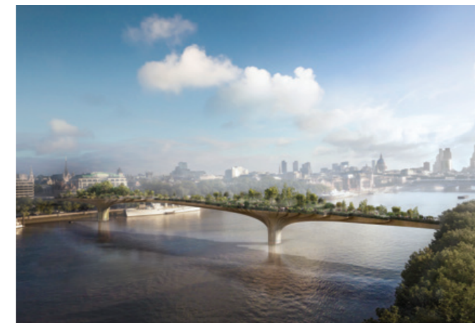
ARUP: Garden Bridge, London. The Garden Bridge is a proposed pedestrian bridge over the River Thames, sitting between Waterloo Bridge and Blackfriars Bridge. Conceived by the actress Joanna Lumley, the bridge will feature trees and plants stretching over 367 metres, 30 metres wide and costing approximately GBP175 million to build and around GBP3 million a year to run

Britain’s proposed mega projects are on a scale not seen for decades within the UK (except for the recent Crossrail project), and will help propel