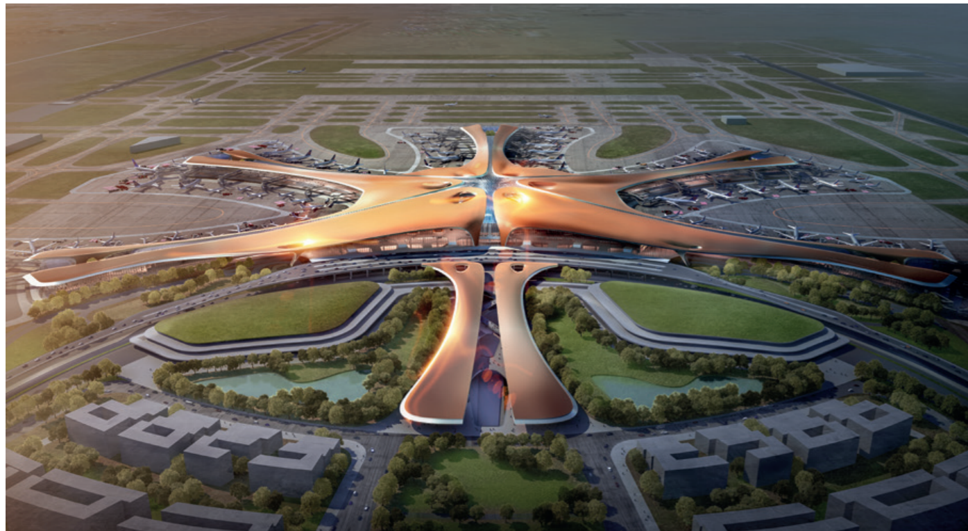
ZAHA HADID ARCHITECTS: Beijing New Airport Terminal Building, Daxing, Beijing, set to become the world's largest airport passenger terminal

the UK economy forward, if they are implemented. Projects include the new GBP50bn High Speed 2 rail connection from London to Birmingham with onward connection with Manchester and Leeds.