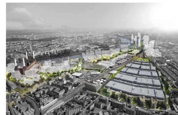
Nine Elms on the South Bank, will be one of London’s greatest transformations, becoming an ultra-modern complex offering 16,000 homes and 25,000 jobs, schools, parks, culture and the arts, set over 196 hectares including the iconic Battersea Power Station